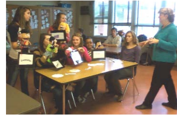
Day 1 Period 10 Class

Visiting Vampires were The Controller, The Drama Queen, The Criticizer, The Narcissist, and The Victim.