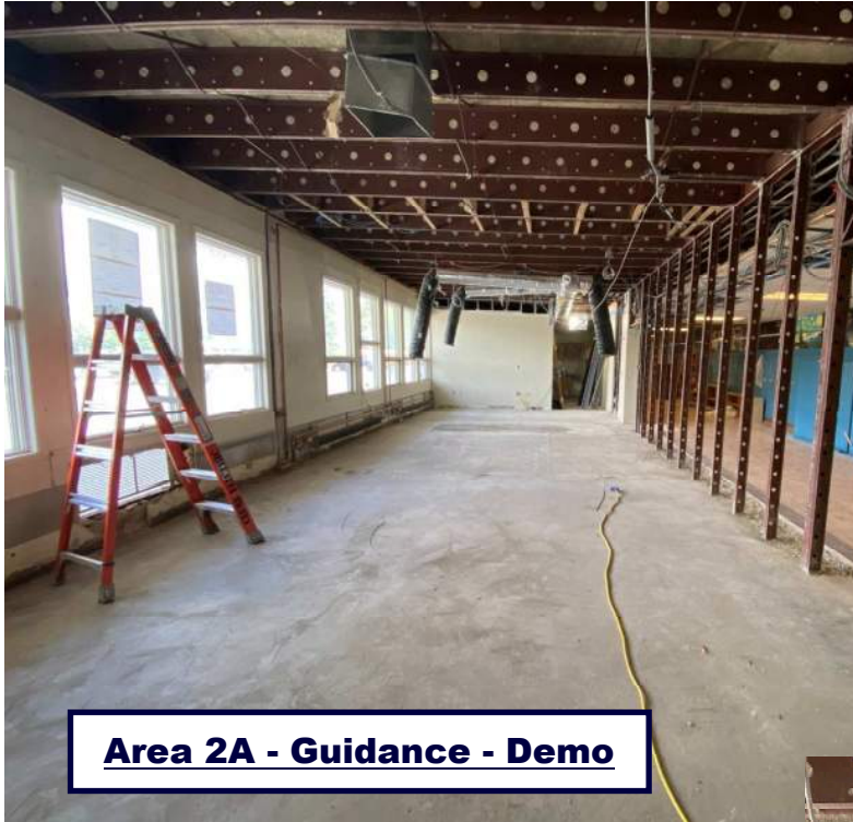
Area 2A - Guidance - Demo