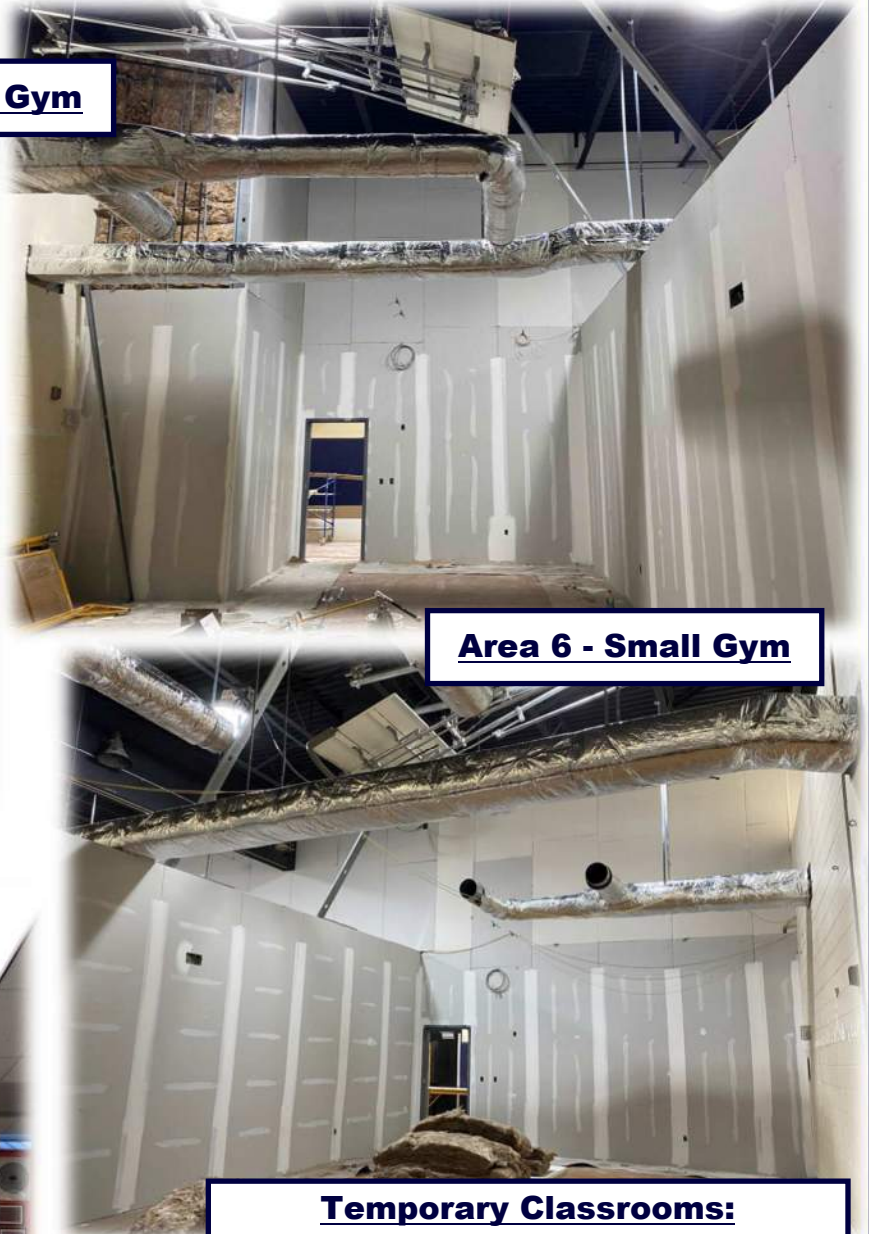
Area 6 - Small Gym