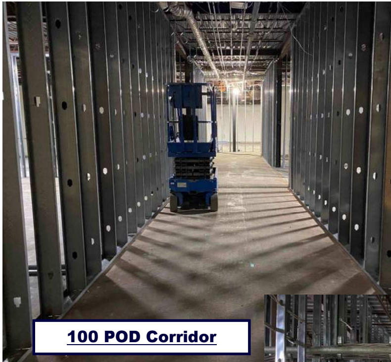
100 POD Corridor