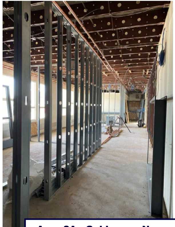
Area 2A - Guidance - New