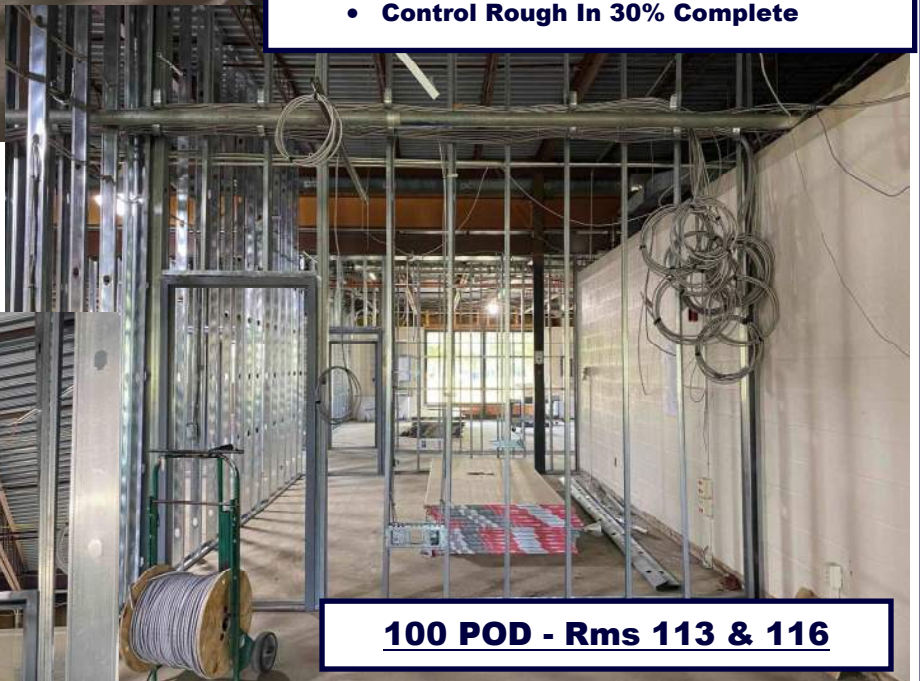
100 POD - Rms 113 & 116