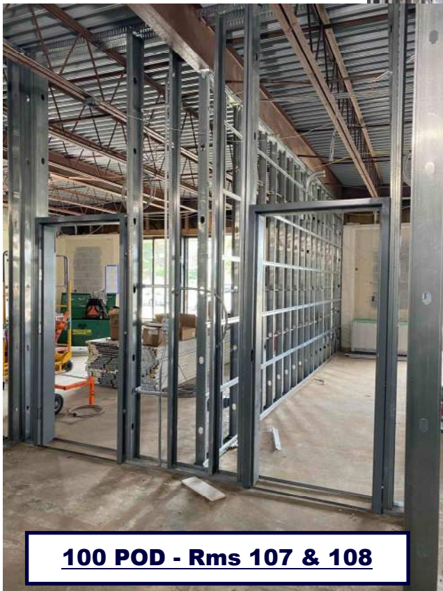
100 POD - Rms 107 & 108