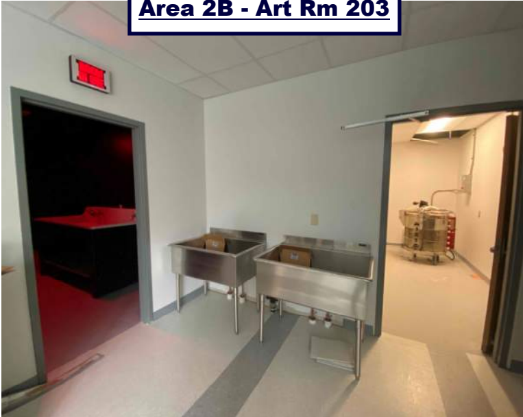
Area 2B - Art Rm 203