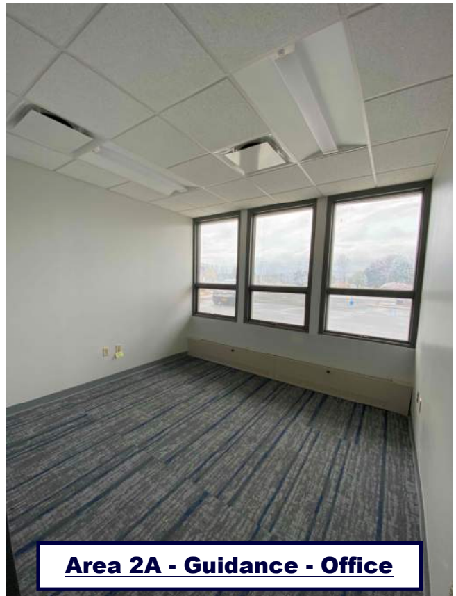
Area 2A - Guidance - Office