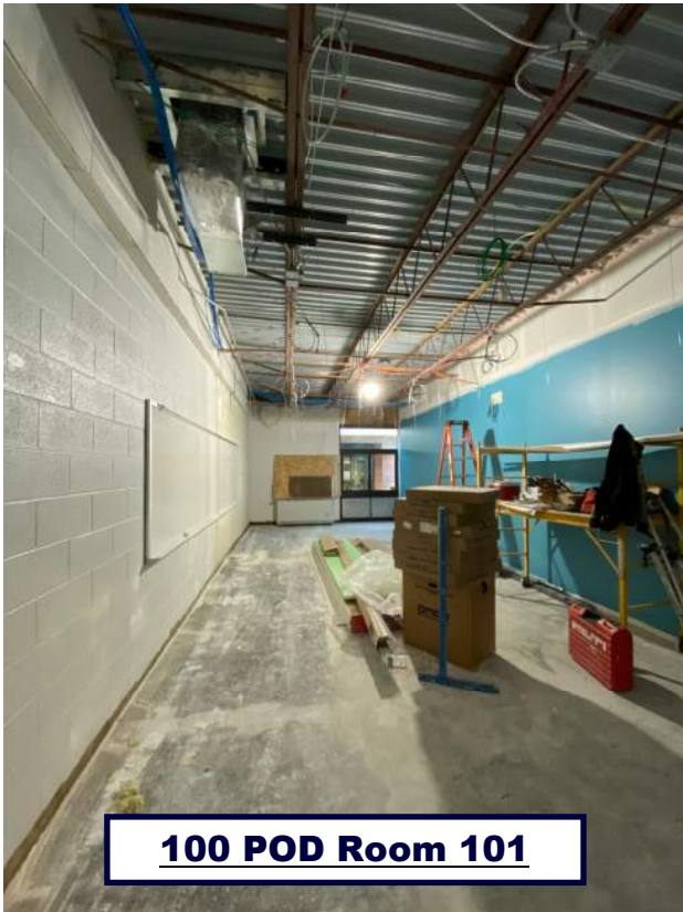
100 POD Room 101