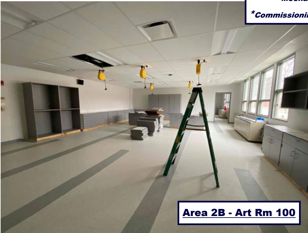
Area 2B - Art Rm 100