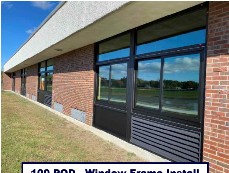
100 POD - Window Frame Install