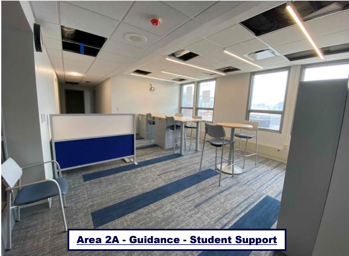
Area 2A - Guidance - Student Support