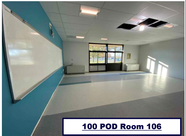
100 POD Room 106