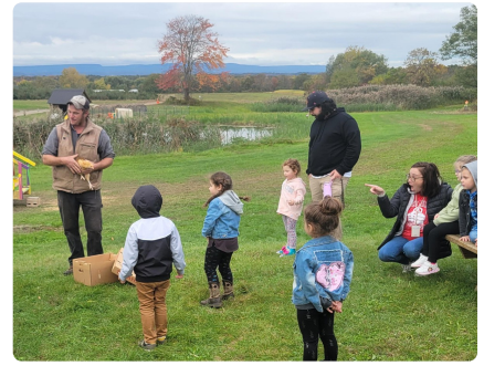
Learning about chickens The owners of Kristy's Barn brought two chickens out for the kids to see and pet.